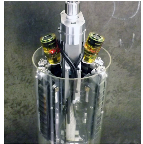
Rectangular Ductwork Crawler Orientation (left) vs Circular Ductwork Robotic Crawler Orientation (right)